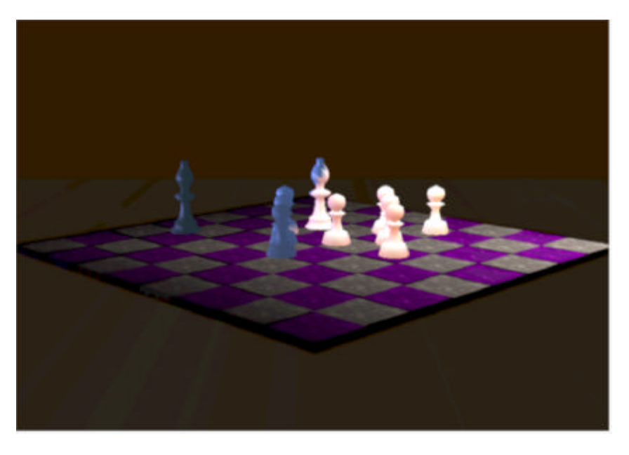
David Perea, 1998, DePaul University

When comparing OpenGL's list of services to the topics covered in a 1980s-type graphics course, one can see that OpenGL provides routines to carry out many of the algorithms mentioned within the list of topics. This opens up the possibility of spending less time on the more elementary two-dimensional topics and concentrating on the three topics, which most students find more challenging. Spending less time of two-dimension issues also gives an instructor the option to cover more advanced topics such as texture mapping and animation. Student projects become more sophisticated. (See figure 3.)